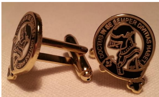
Cufflinks – (£10 Pair)