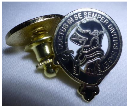
Tie Tack/Lapel badge (£5 each)