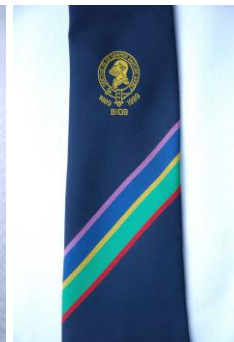
Tie – (£10 each)

As a further additional option, you can now order your Cufflinks and Tie Tack/Lapel Badge, and Tie through PayPal™ , and have them before the dinner. Same prices as above. Send the payments for the Cufflinks, the Tie Tack/Lapel Badge, or the Tie, to Purchase@BIOB.co.uk . Be sure to include your name and the postal address as a reference. Postage is £2 per order, so make sure you add £2 to one of the items if you're ordering the full set.